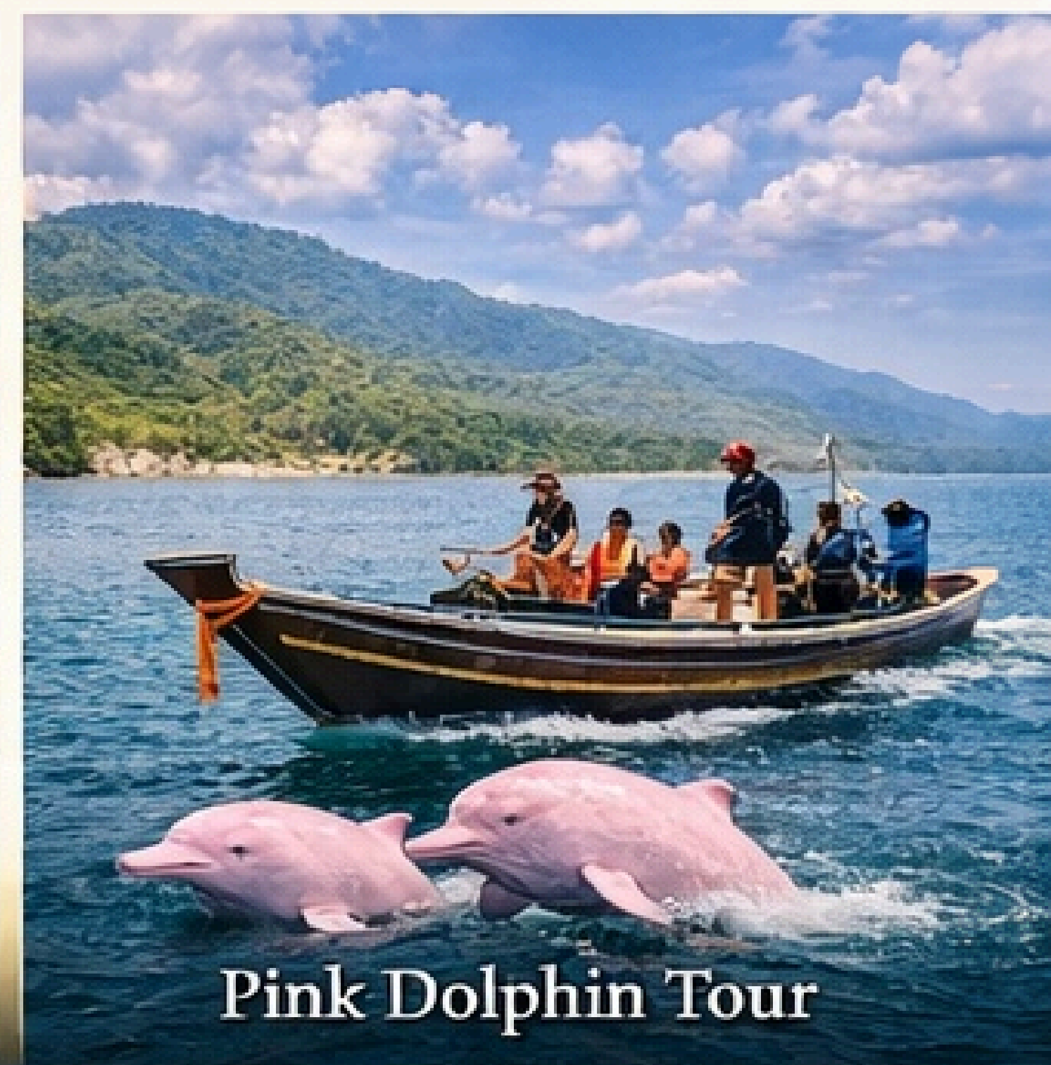
Pink Dolphin Tour

Exclusive Trip for Nakhon Si Thammarat International GO OPEN Participants