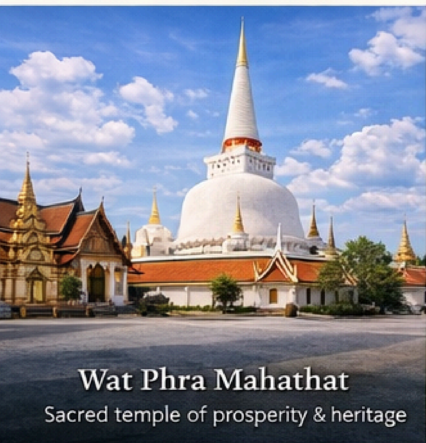
Wat Phra Mahathat

All-inclusive package (hotel, meals, and all activities included) 2 persons per room | Single supplement +2,200 THB